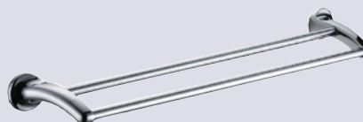
Base Double Towel Rail