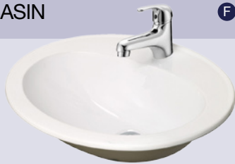
Oval white inset Kado Arc