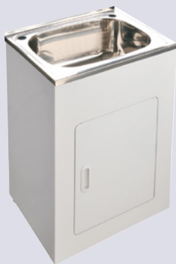
Laundry Trough Base 43 ltr