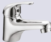
Posh Bristol MK2 Basin Mixer