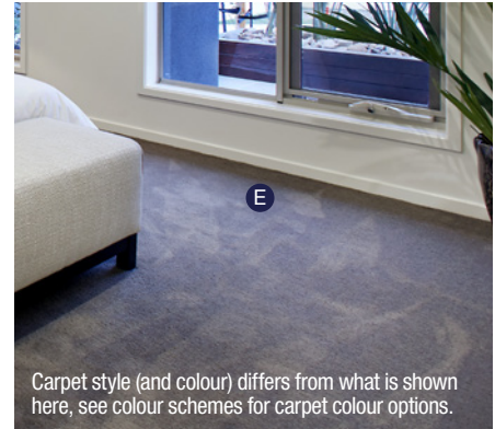
Carpet style (and colour) differs from what is shown here, see colour schemes for carpet colour options.