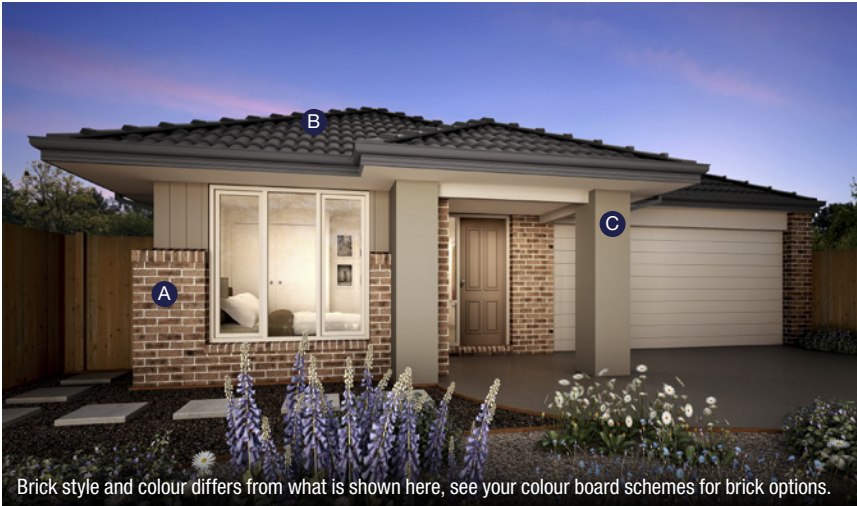
Brick style and colour differs from what is shown here, see your colour board schemes for brick options.