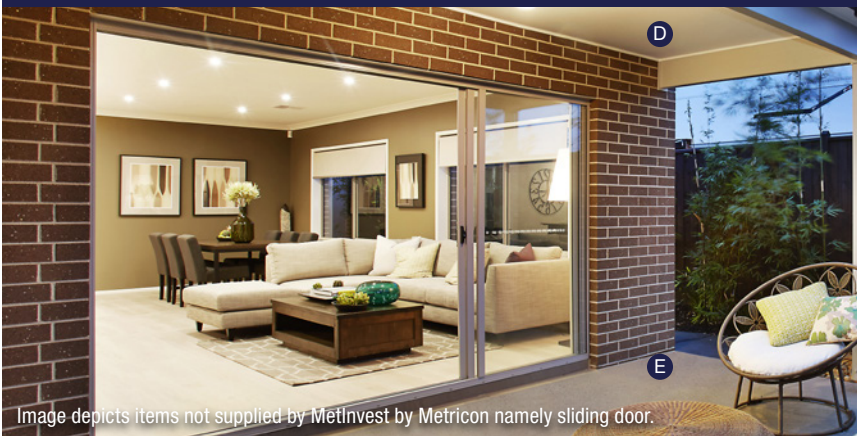
Image depicts items not supplied by MetInvest by Metricon namely sliding door.