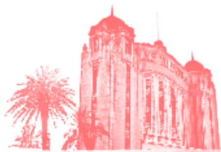
The Palais Theatre

There's plenty to do outside, but when you feel like getting out of the sun, there's a myriad of places you can explore. If you're after a bite to eat or a casual drink, your biggest problem is going to be choosing between the almost limitless number of cafés, restaurants, bars, pubs and lounges that inhabit the local streets.