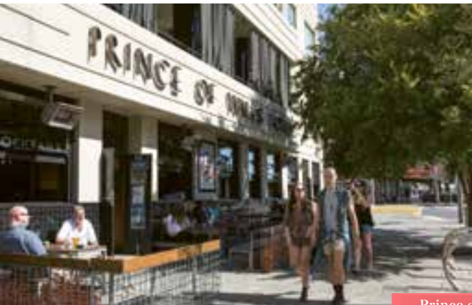
Prince of Wales