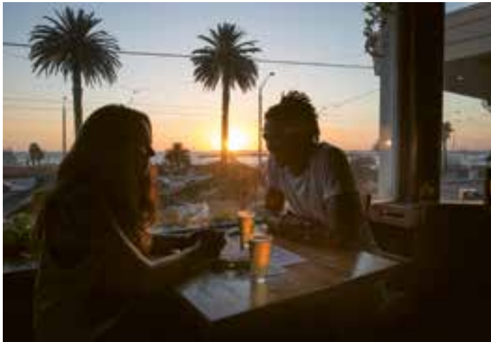
The Esplanade Hotel