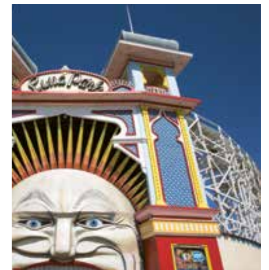
St Kilda Esplanade

Acland Street brings a laid back, retro feel. Barkly Street is independent and ever evolving and Fitzroy Street morphs from edgy to elegant in the space of one kilometre.