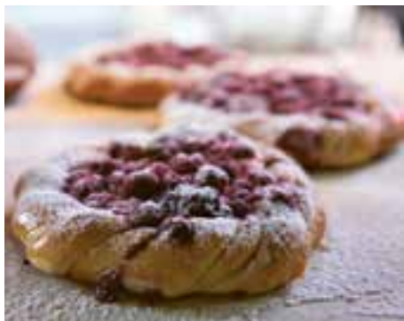
Europa Cake Shop