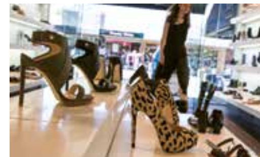
Acland Street Boutiques

Acland Street brings a laid back, retro feel. Barkly Street is independent and ever evolving and Fitzroy Street morphs from edgy to elegant in the space of one kilometre.