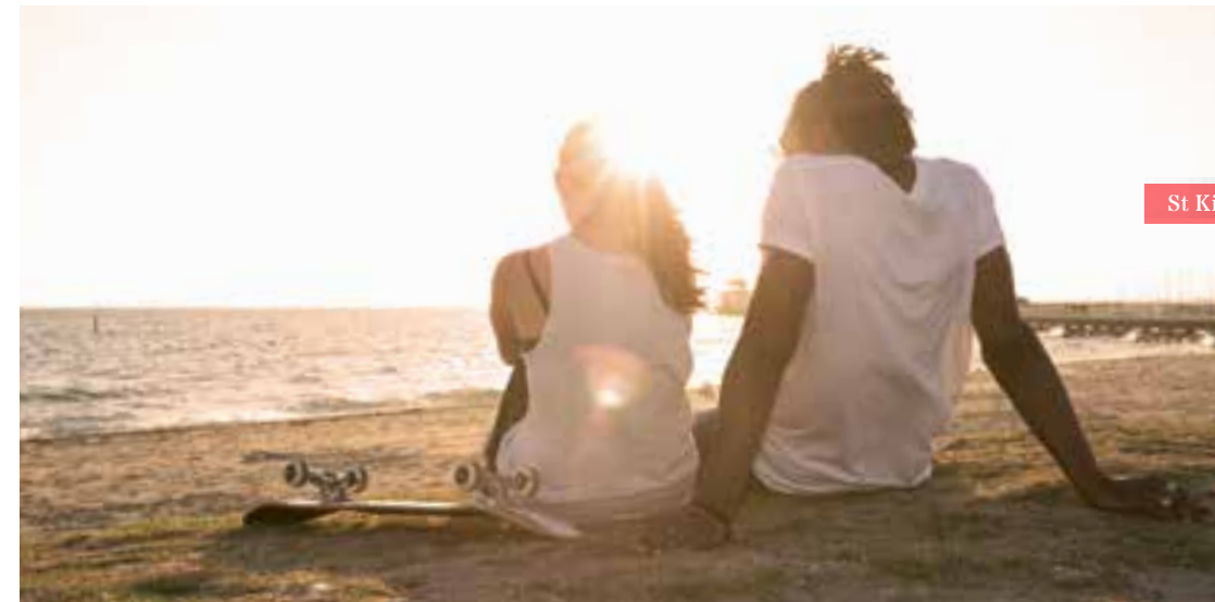
St Kilda Beach