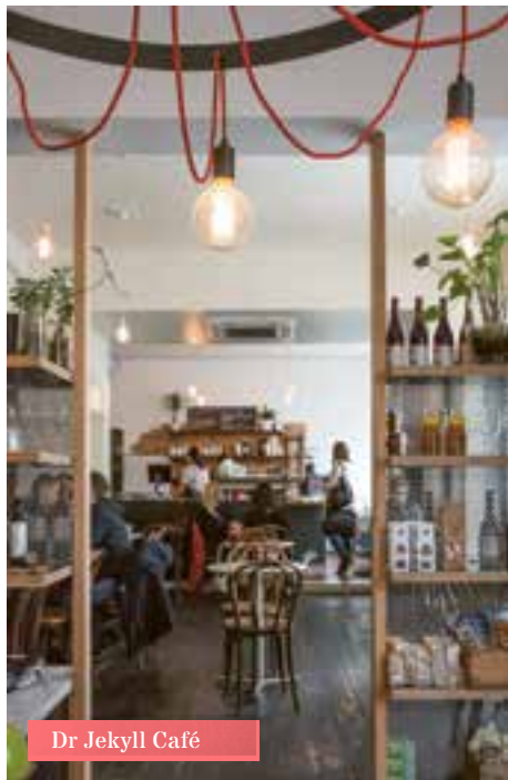
Dr Jekyll Café