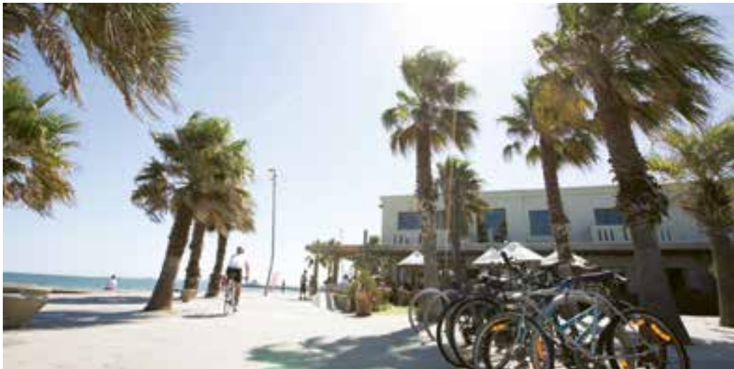
St Kilda Beach