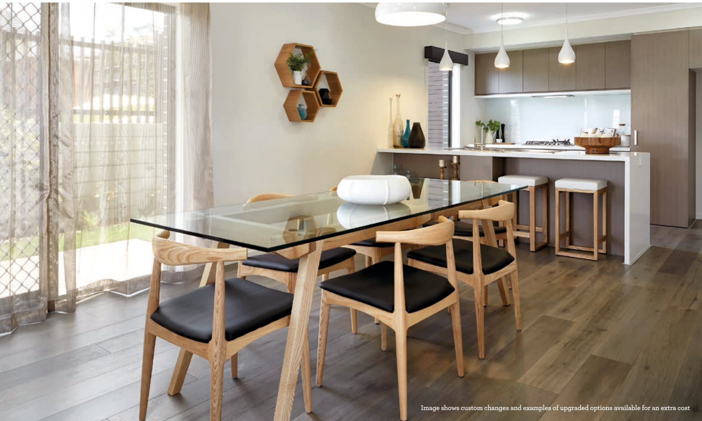
Image shows custom changes and examples of upgraded options available for an extra cost

Prepare to upgrade your lifestyle. Valley Park’s homes have been architecturally designed from the ground up to offer you an opportunity to live in a place that feels made for you.